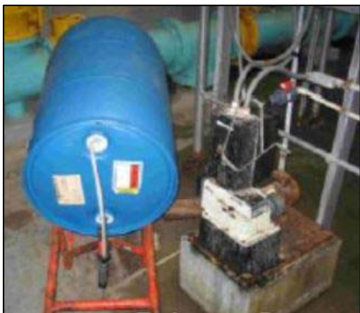
Old polymer feed – no mixing