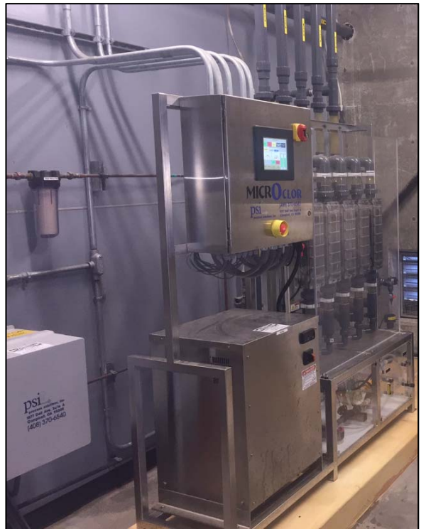
Nunes Treatment Plant 100 PPD Microclor® OSHG system

A key part of the upgrade effort was focused on the elimination of one-ton chlorine gas cylinders at Nunes and 150-lb pressurized gas cylinders at Denniston. Aside from the obvious improvements in operator and community safety (liquid containment of 0.8% sodium hypochlorite leak is far easier to manage than a chlorine gas leak), the cost savings related to the risk management plan and emergency scrubber maintenance made sense. CCWD undertook an effort to interview and analyze the on-site hypochlorite generation (OSHG) offerings from the four largest suppliers in North America. Weighing heavily in the analysis were the related issues of dependability and reliability. As Sean Donovan, Treatment Plant Supervisor put it, "We are the vanguard of public health. We don't get a day off, so we have to have reliable equipment". CCWD ultimately chose the Process Solutions, Inc. Microclor® OSHG system for both plants with Denniston installing a 40 pound-per-day (pounds of equivalent chlorine gas) first and Nunes utilizing a 100 pound-per-day system about a year later.