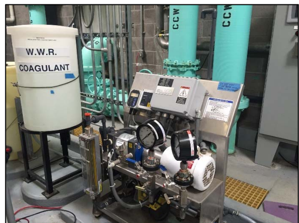
PolyBlend® polymer activation resulted in 20% savings in polymer